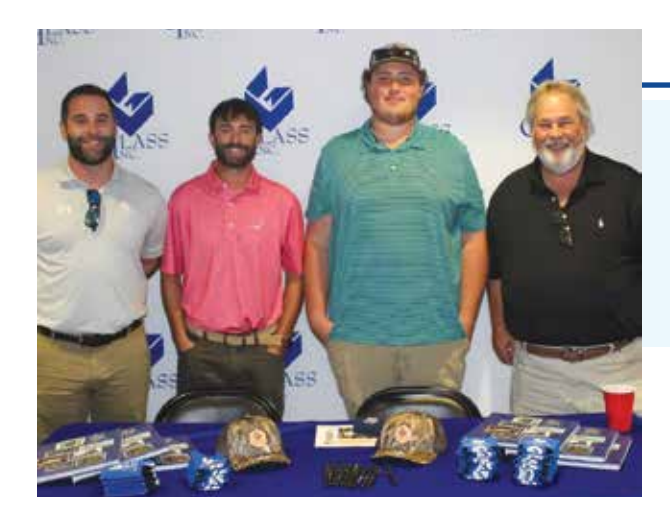
Our Meridian crew representing us well at the ABC trade show in August!