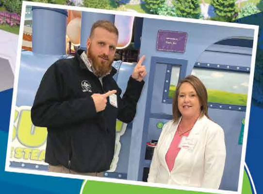
SUSIE THE STEAM ENGINE Made possible by Glass Inc.

We are so thrilled to have been a part of this amazing project in our hometown of Meridian, MS. This facility will help enrich the lives of children within our community and surrounding areas for years to come. What an amazing project to be involved in. Thank you to everyone who worked so hard to make this a reality!