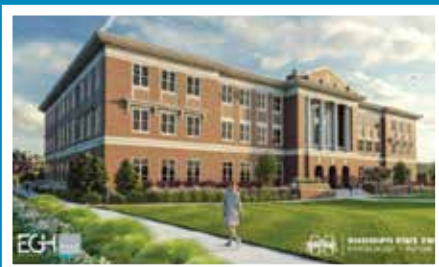
The Duff in Starkville