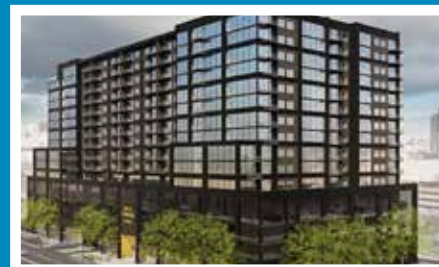
19th and Church

Glass Inc. is extremely proud to be starting our first-ever job in Nashville, 19th and Church, as a joint venture with our friends at Tull Brothers!