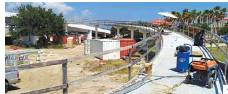
3 Ocean Aero