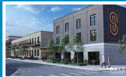
The OS Hotel